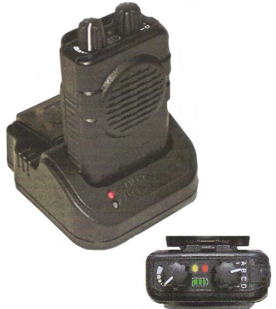
Part #2885 for Pager